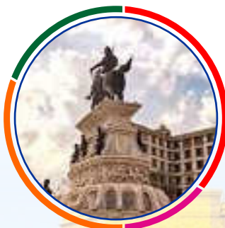
STATUE OF MAHARAJA RANJIT SINGH