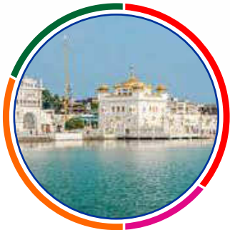
TARN TARAN SAHIB