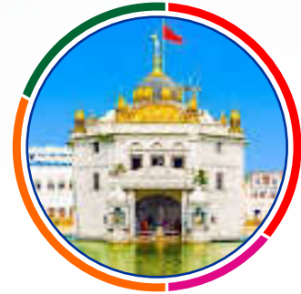
SHRI DURGIANA TEMPLE