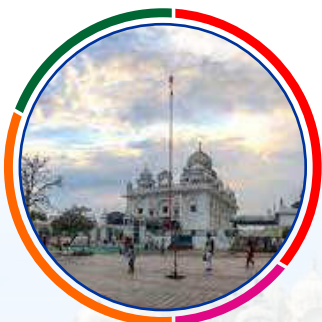
GURUDWARA CHHEHARTA SAHIB