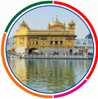
SRI HARMANDIR SAHIB