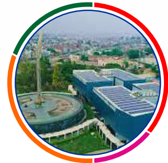
PUNJAB STATE WAR HERO'S MEMORIAL & MUSEUM